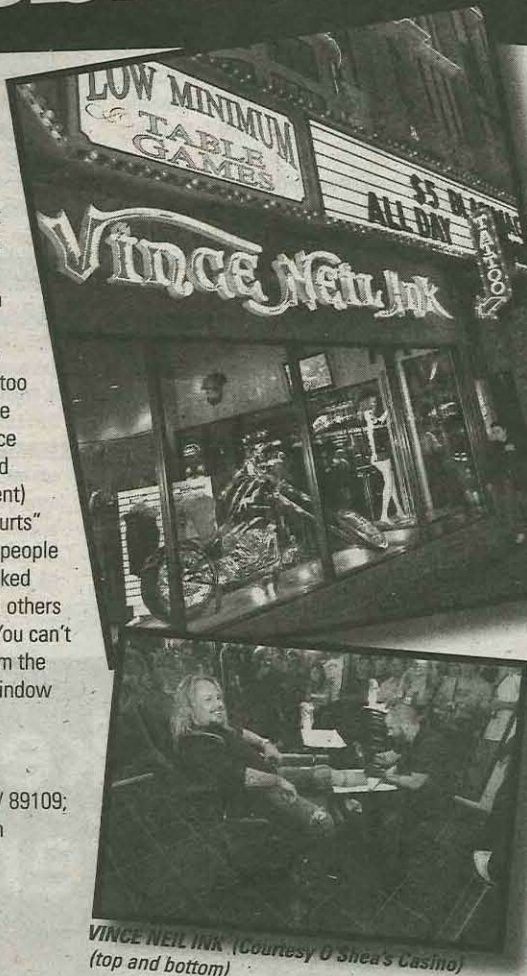
VINCE NEIL INK (top and bottom)

Vince Neil Ink inside O'Shea's Casino, 3555 Las Vegas Blvd. S., Las Vegas, NV 89109; (702) 733-3212 www.vinceneilink.com