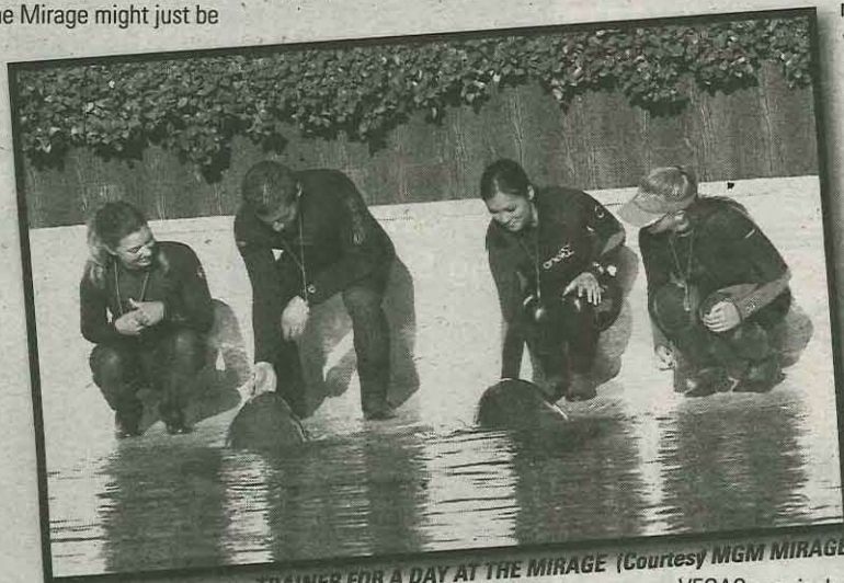
TRAINER FOR A DAY AT THE MIRAGE

Trainer for a Day program at Siegfried & Roy's Secret Garden and Dolphin Habitat at The Mirage, 3400 S. Las Vegas Blvd., Las Vegas, NV 89109; www.mirage.com . For Trainer for a Day reservations call (702) 792-7889